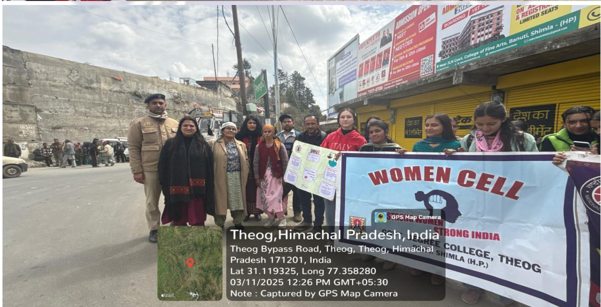
Theog, Himachal Pradesh, India Theog Bypass Road, Theog, Theog, Himachal Pradesh 171201, India Lat 31.119325, Long 77.358280 03/11/2025 12:26 PM GMT+05:30 Note : Captured by GPS Map Camera