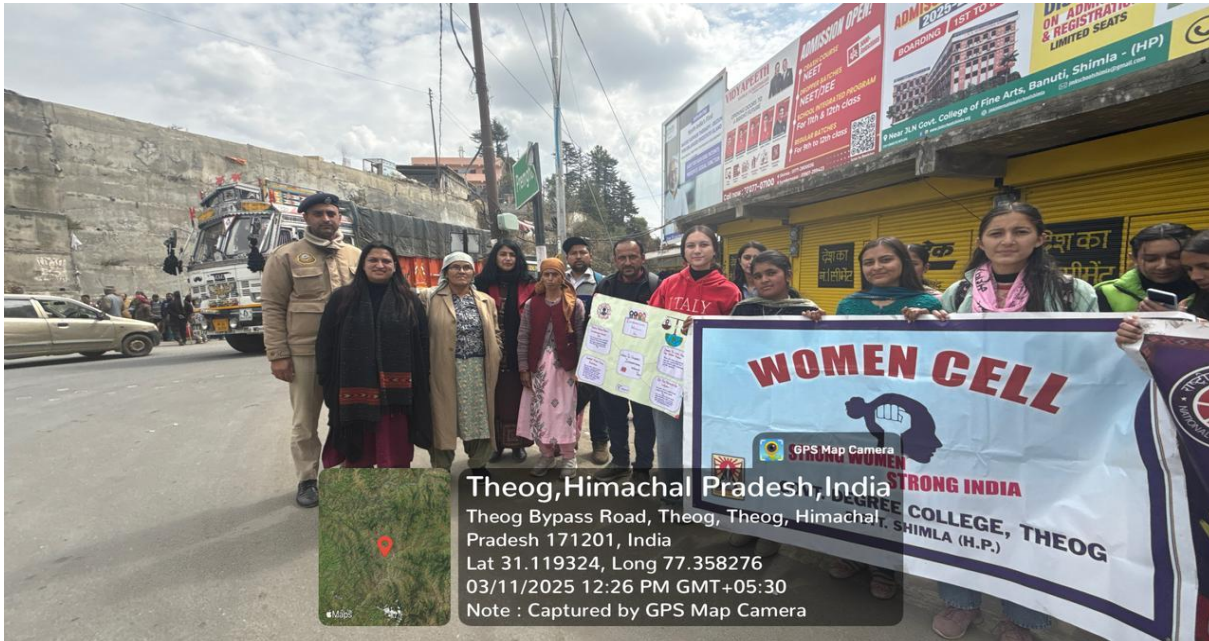
Theog, Himachal Pradesh, India Theog Bypass Road, Theog, Theog, Himachal Pradesh 171201, India Lat 31.119324, Long 77.358276 03/11/2025 12:26 PM GMT+05:30 Note : Captured by GPS Map Camera