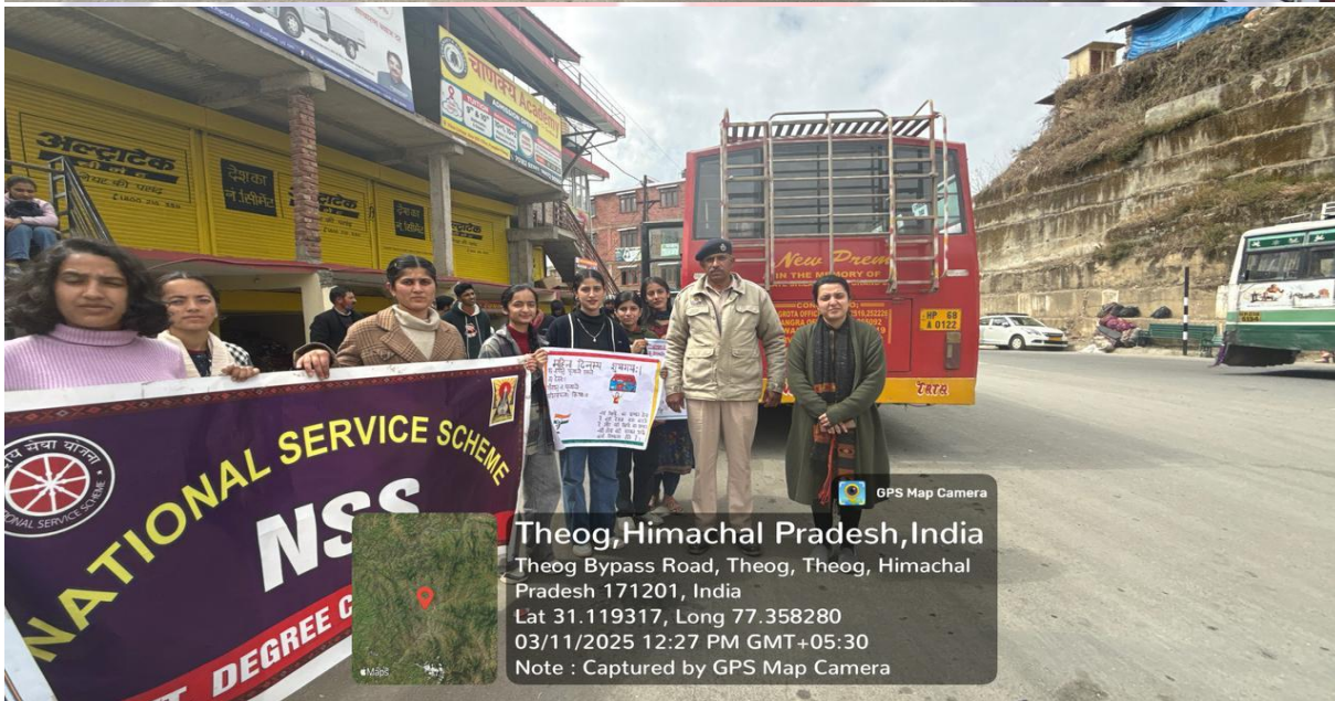
Theog, Himachal Pradesh, India Theog Bypass Road, Theog, Theog, Himachal Pradesh 171201, India Lat 31.119317, Long 77.358280 03/11/2025 12:27 PM GMT+05:30 Note : Captured by GPS Map Camera